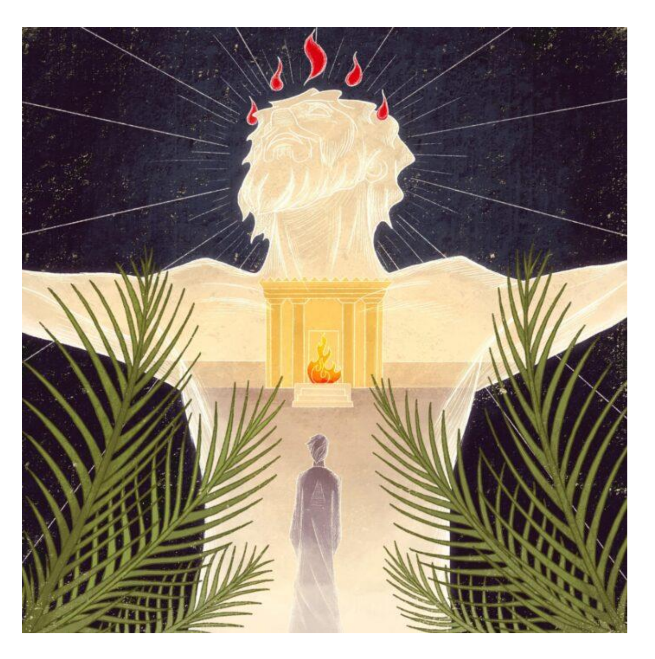
Rethinking Real Strength