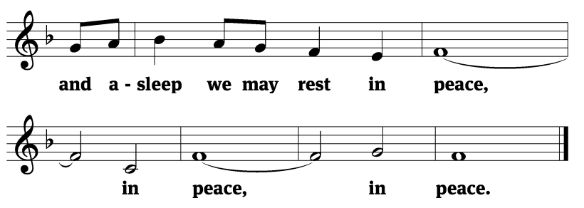
Tune: Dale A. Witte Tune: © 2002 Northwestern Publishing House. Used by permission: OneLicense no. 708875